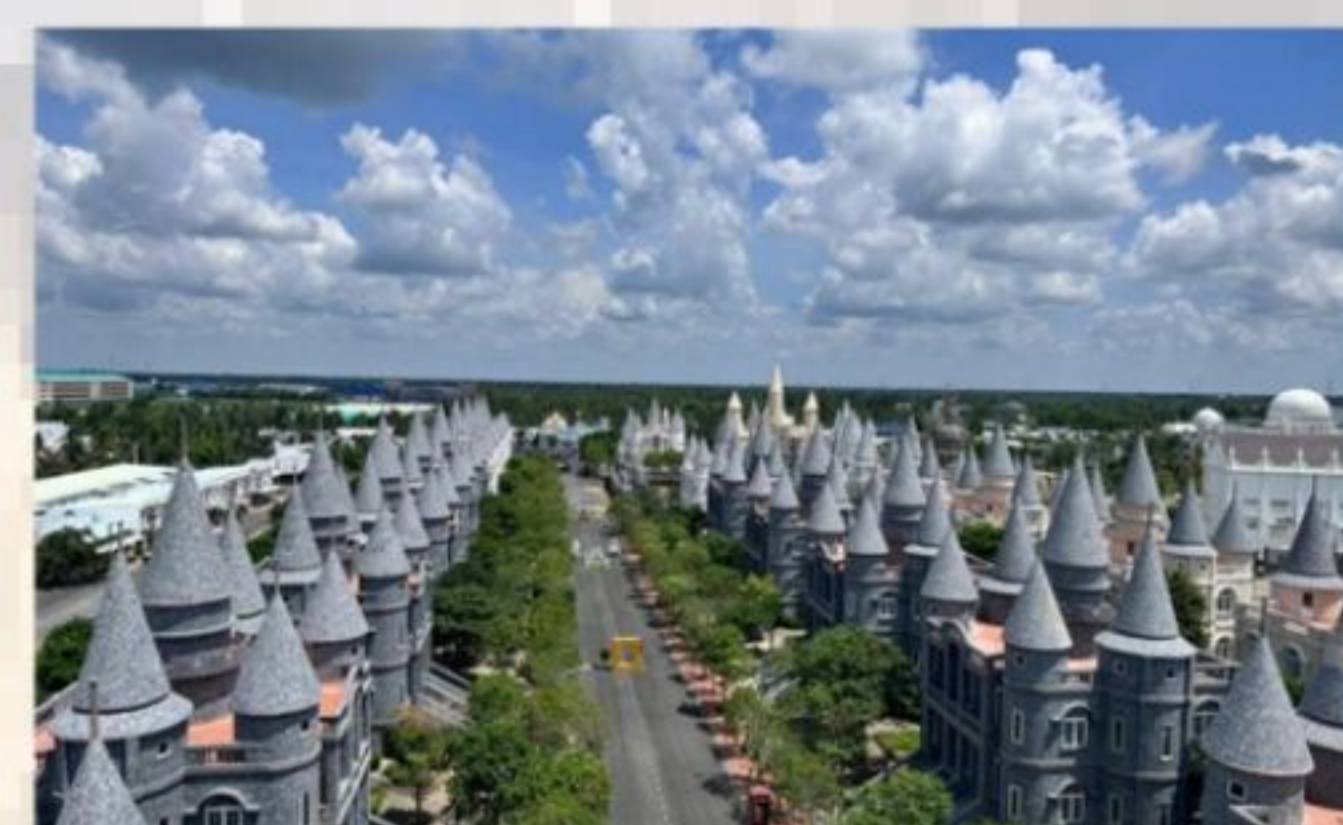
High Class Dormitory