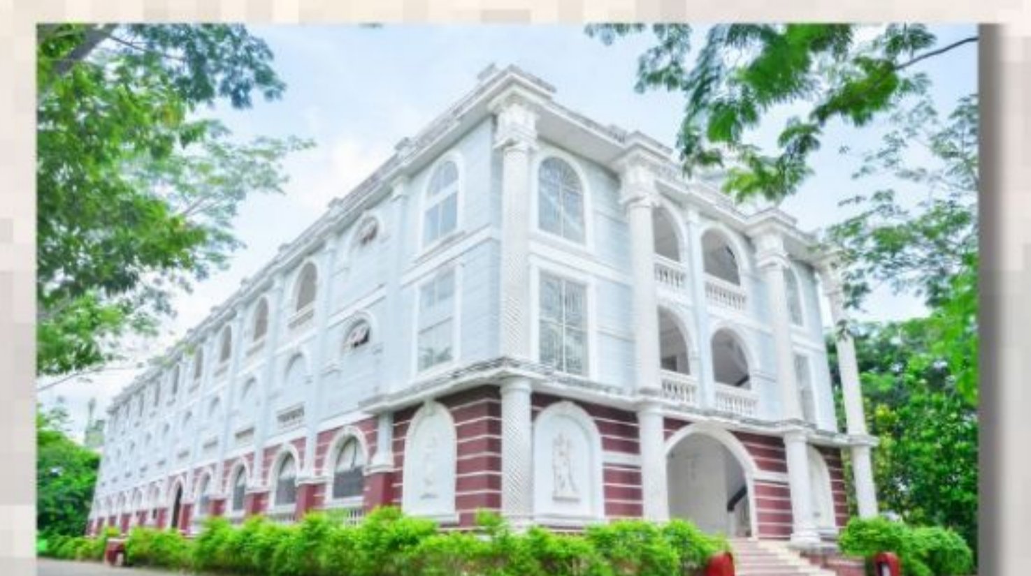
National Defence & Security Education Teaching Centre