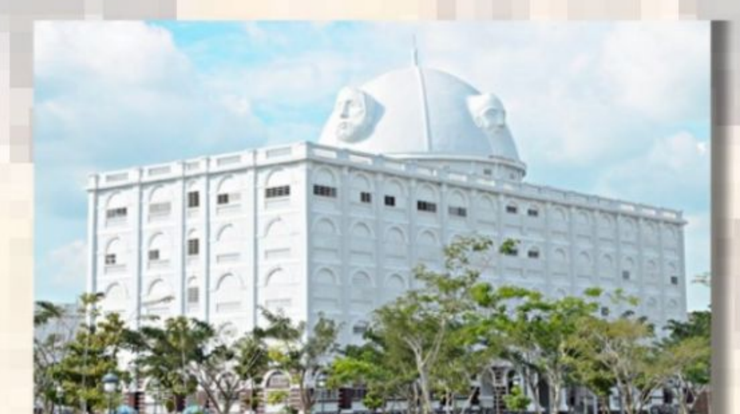
Medical Practice Centre